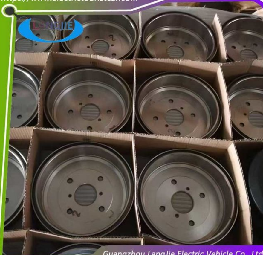
Guangzhou LangJie Electric Vehicle Co., Ltd