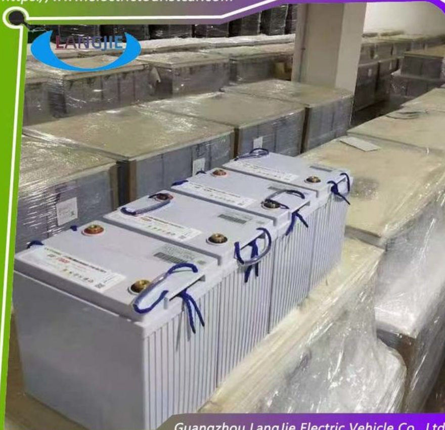
Guangzhou LangJie Electric Vehicle Co., Ltd