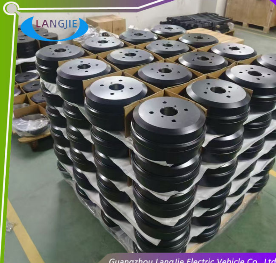
Guangzhou LangJie Electric Vehicle Co., Ltd