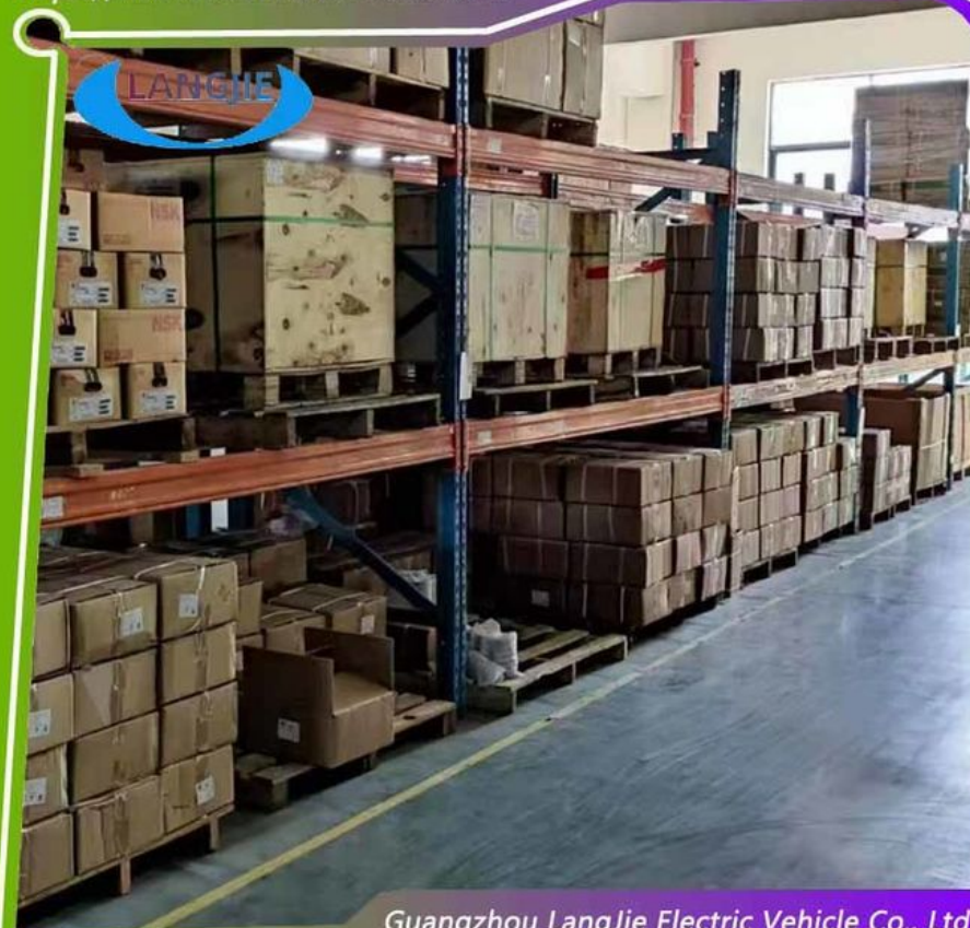
Guangzhou LangJie Electric Vehicle Co., Ltd

Professional to provide domestic manufacturers of electric vehicle repair parts