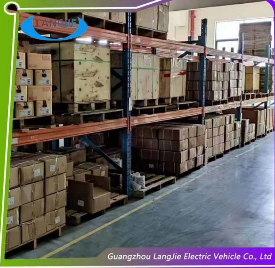
Guangzhou LangJie Electric Vehicle Co., Ltd

Professional to provide domestic manufacturers of electric vehicle repair parts