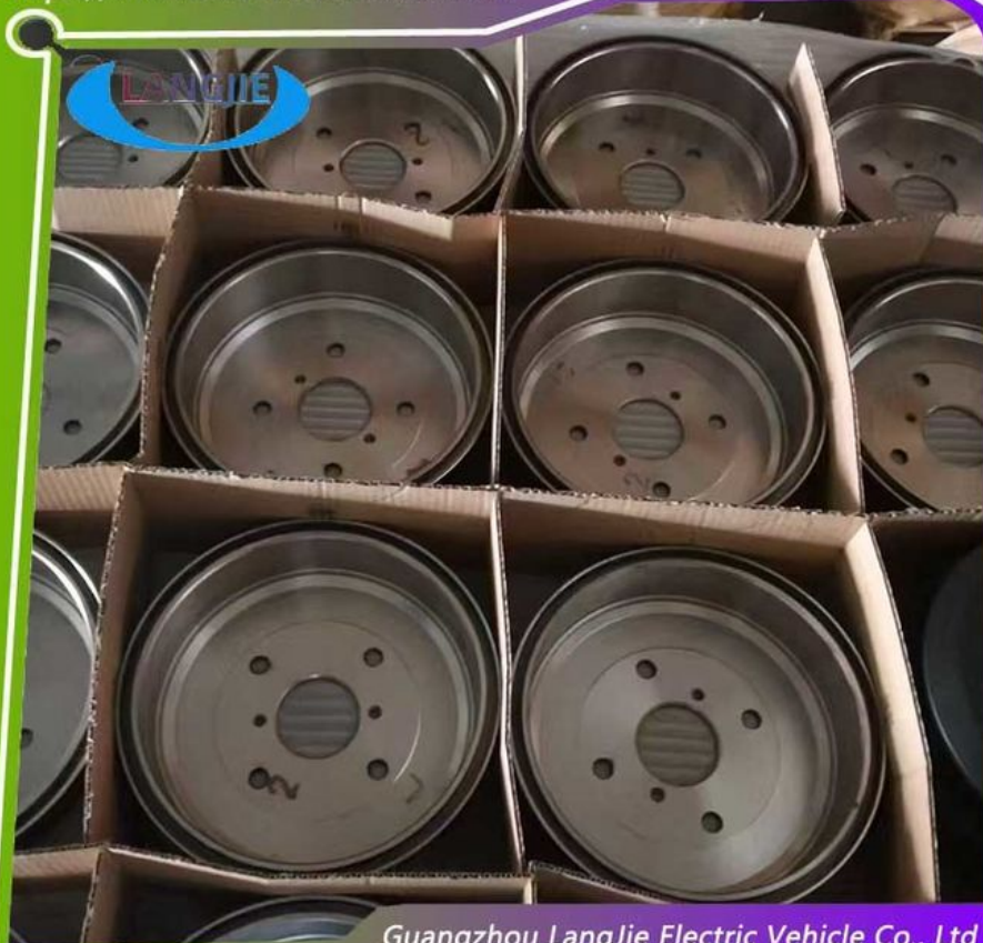
Guangzhou LangJie Electric Vehicle Co., Ltd