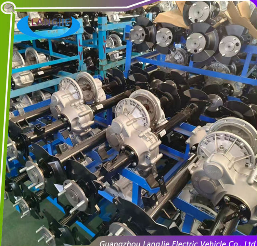
Guangzhou LangJie Electric Vehicle Co., Ltd