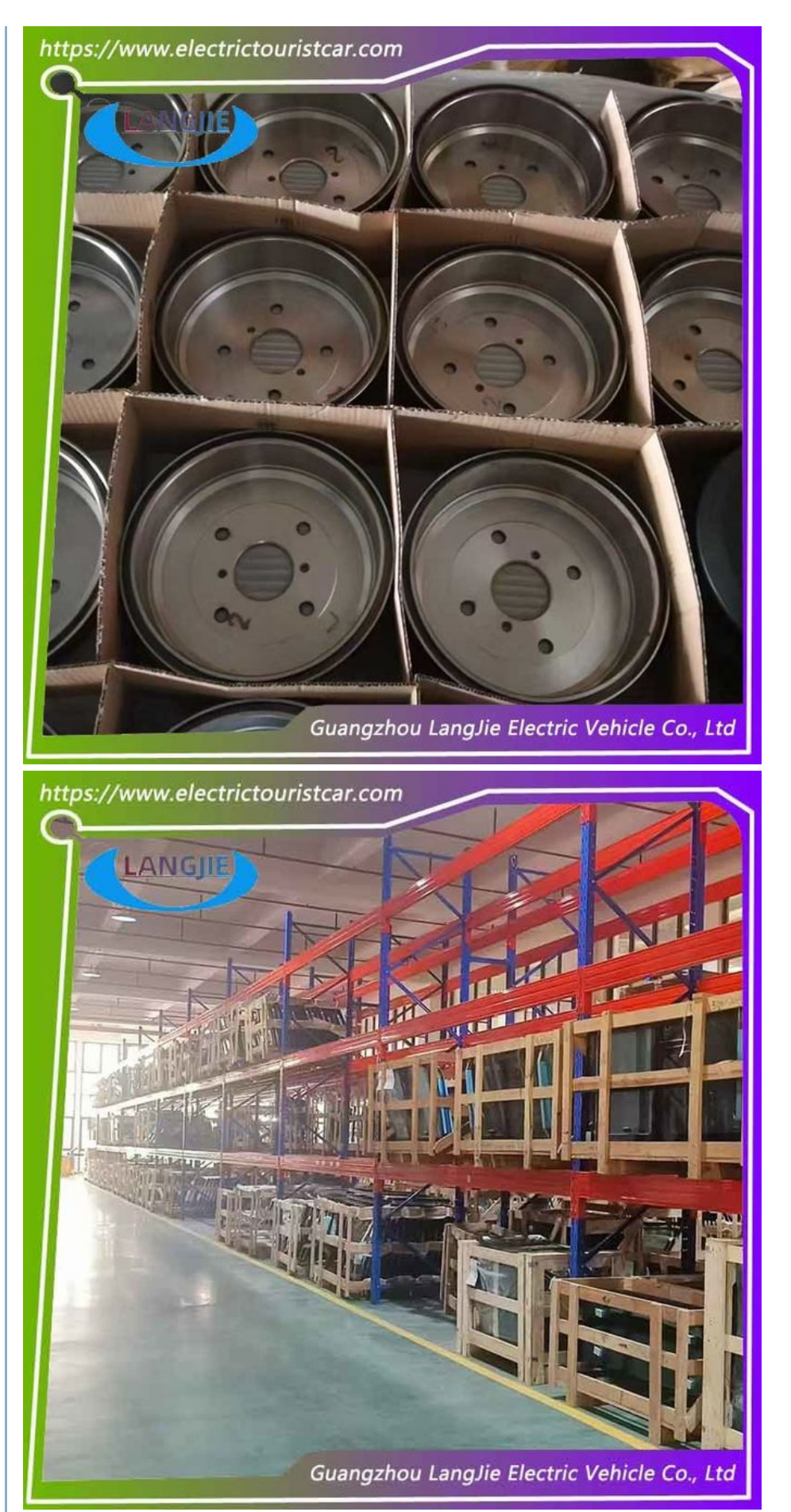
Professional to provide domestic manufacturers of electric vehicle repair parts Applicable models:Club Cart Shuttle Bus Classic Car Packing :Carton Box Air Transportation International Express :DHL,TNT,FedEx,UPS,EMS,ETC.