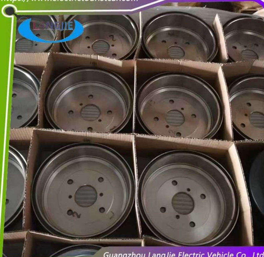
Guangzhou LangJie Electric Vehicle Co., Ltd