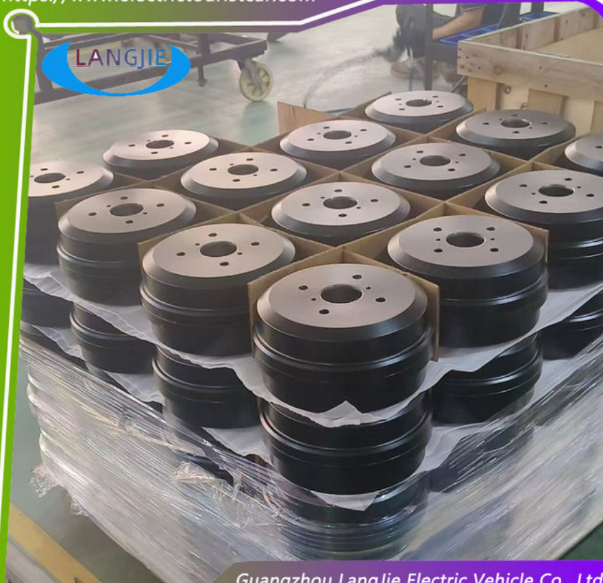
Guangzhou LangJie Electric Vehicle Co., Ltd