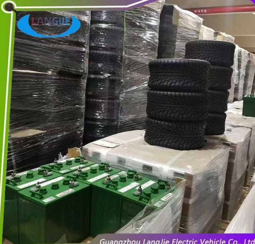
Guangzhou LangJie Electric Vehicle Co., Ltd