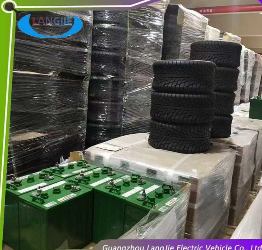
Guangzhou LangJie Electric Vehicle Co., Ltd