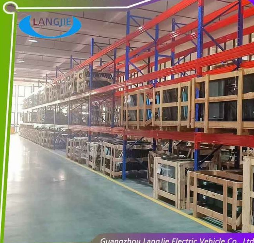
Guangzhou LangJie Electric Vehicle Co., Ltd

Professional to provide domestic manufacturers of electric vehicle repair parts