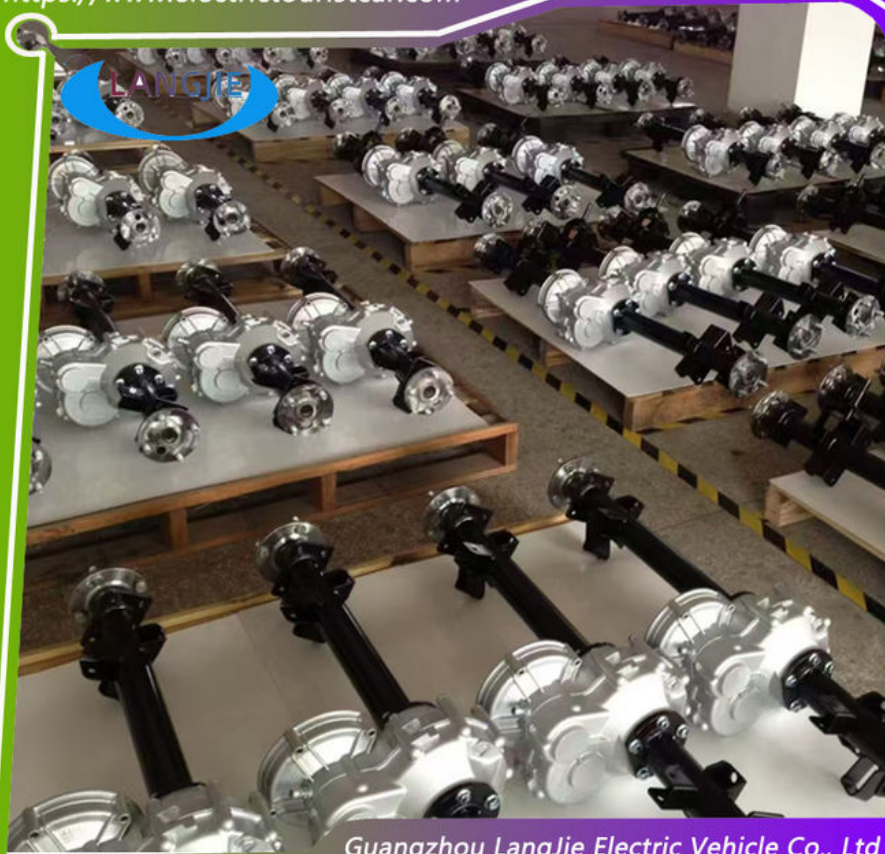
Guangzhou LangJie Electric Vehicle Co., Ltd