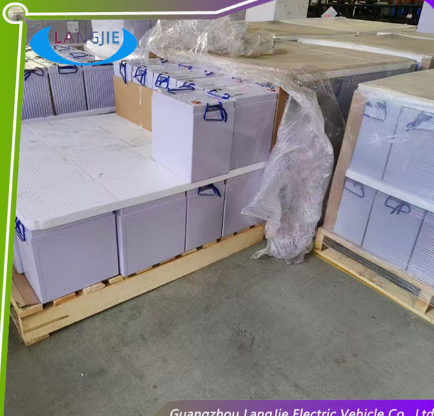
Guangzhou LangJie Electric Vehicle Co., Ltd