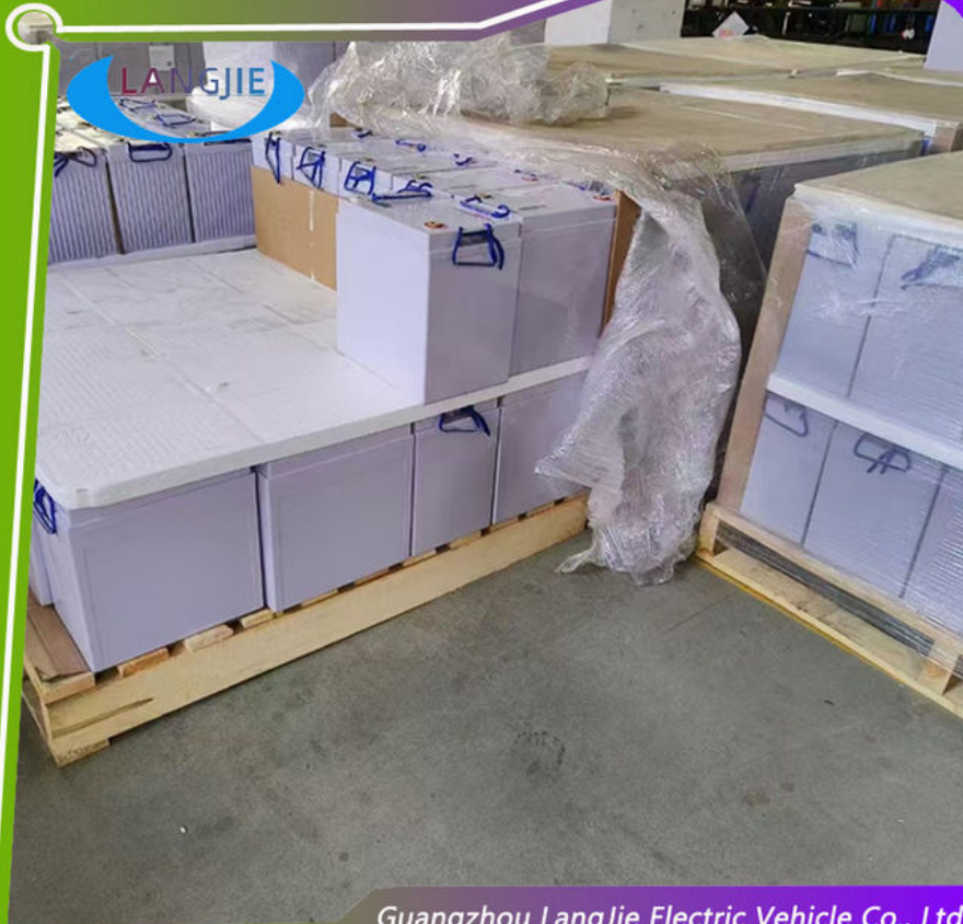
Guangzhou LangJie Electric Vehicle Co., Ltd