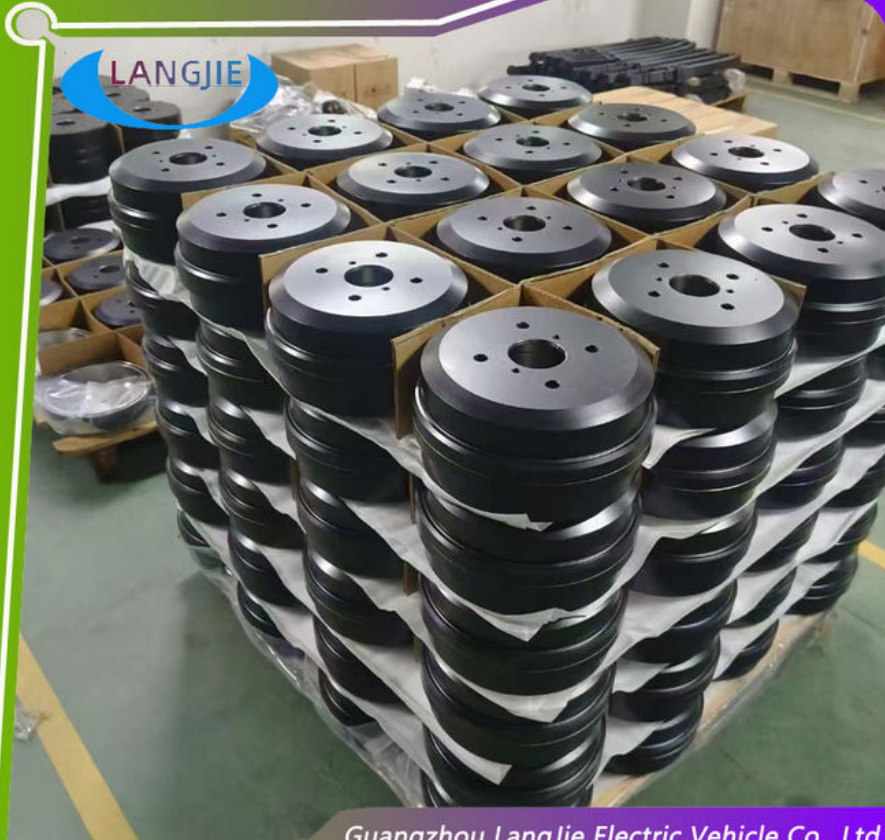
Guangzhou LangJie Electric Vehicle Co., Ltd