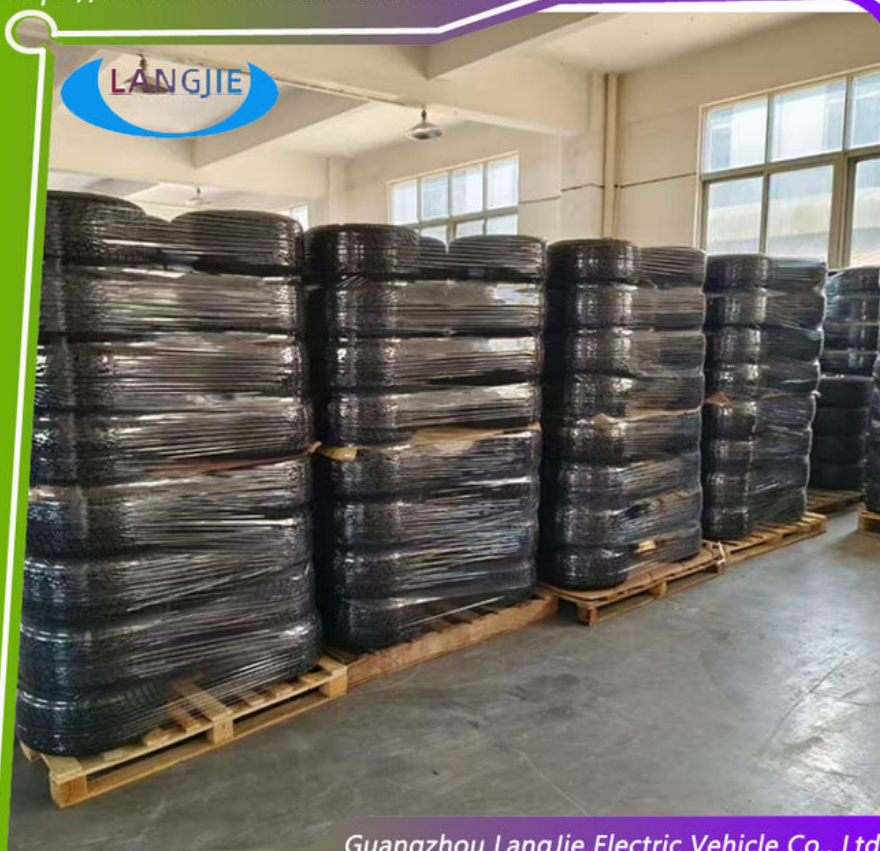
Guangzhou LangJie Electric Vehicle Co., Ltd