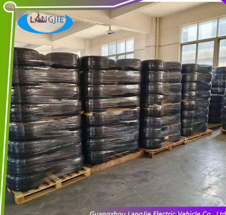
Guangzhou LangJie Electric Vehicle Co., Ltd