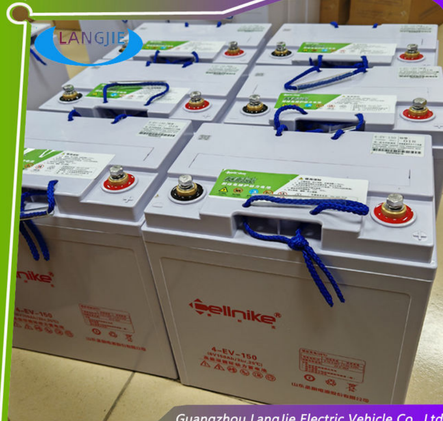
Guangzhou LangJie Electric Vehicle Co., Ltd