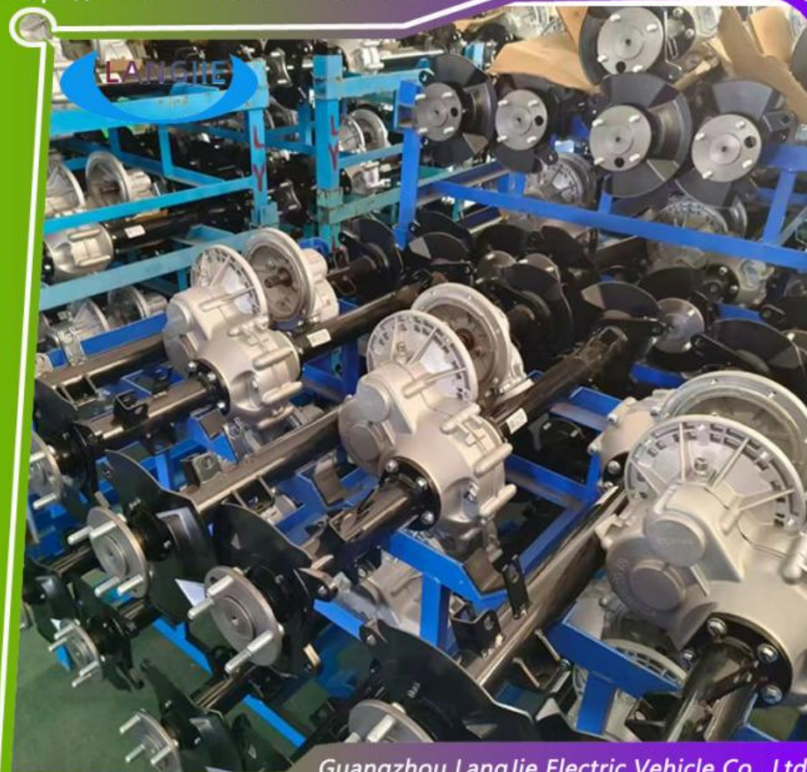
Guangzhou LangJie Electric Vehicle Co., Ltd