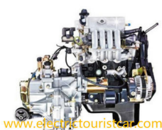
Powerful Gasoline Engine